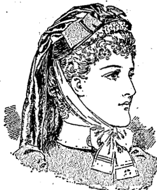
The "St. Bride's" Bonnet. Made of fine Straw with Lace and ruching, and trimmed with Ribbon, and long Silk Gossamer Fall. In black and colours, 12/6 each. Without Fall, 9/6; also The "St. Clare" Bonnet. 6/11 complete.