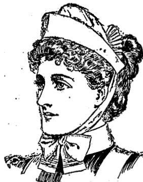
The New "Sister Dora" Cap. Made of washing Cambric, with draw strings. Can be washed as easily as a handkerchief. 1/-. Without strings, 10½d.