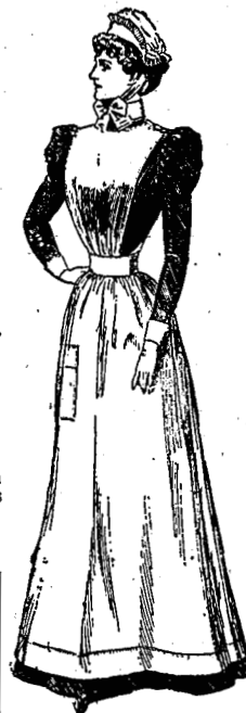
The "Rena" Apron. Made of linen finished Cloth lock-stitch throughout, 2/6 each. In two sizes, 36 in. & 39 in. from waist to hem.

PATTERNS FREE OF THE New Washing Materials for Nurses' Dresses,